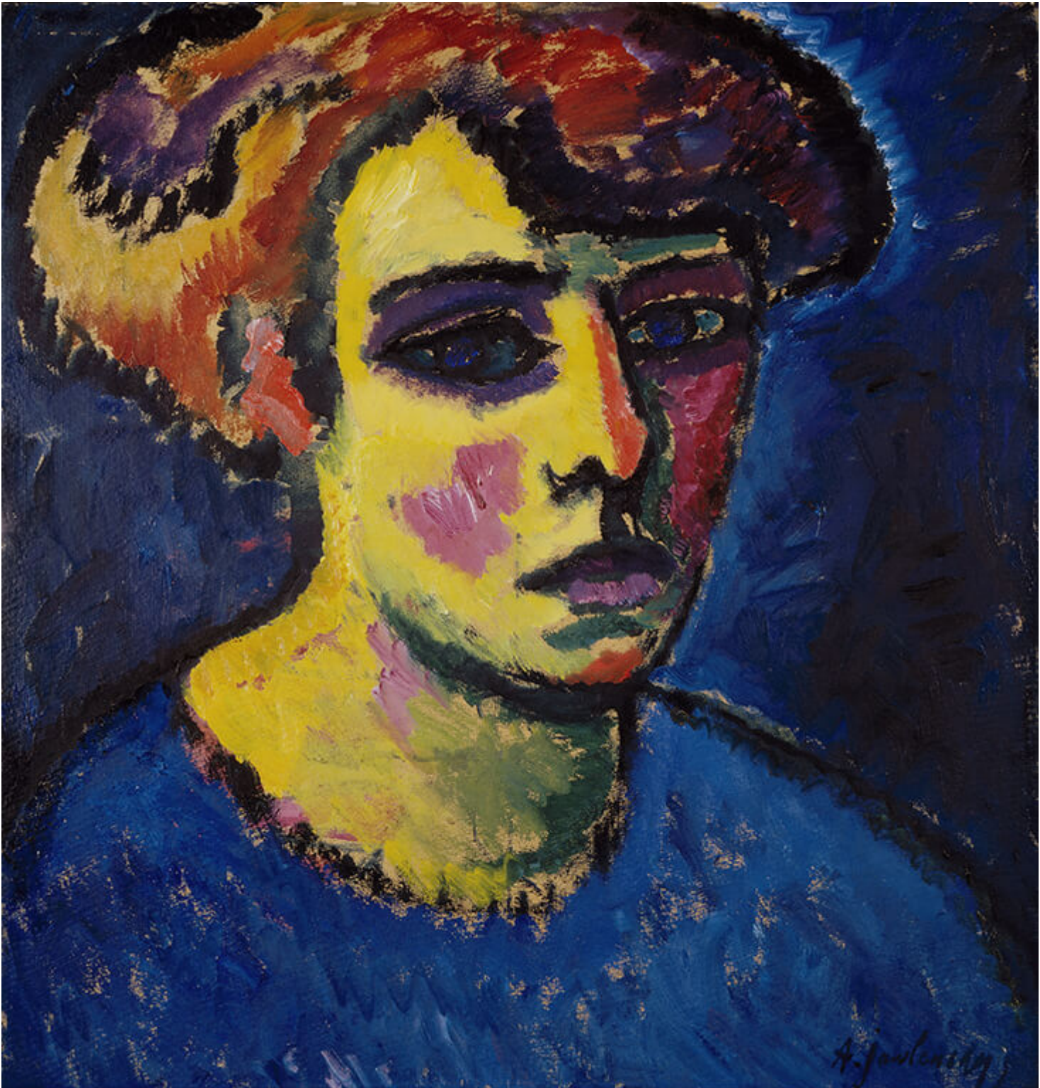
Frauenkopf (Head of a Woman) / Alexej von Jawlensky / 1911

Portraiture became an important strand of Jawlensky's practice following his Fauvist period. Returning to his Russian roots, he adopted the visual