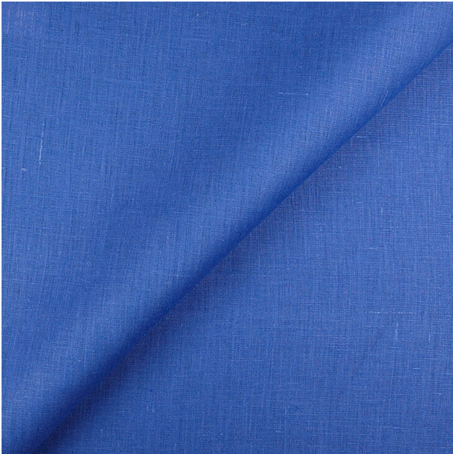
FS SAPPHERE Softened 100% Linen

In 1905 Jawlensky travelled to France, picking up influences from the Post-Impressionist painters Paul Gauguin and Vincent van Gogh, whose heightened colours and exaggerated forms were moving away from reality and into the realms of the imagination. But he found the closest kinship with